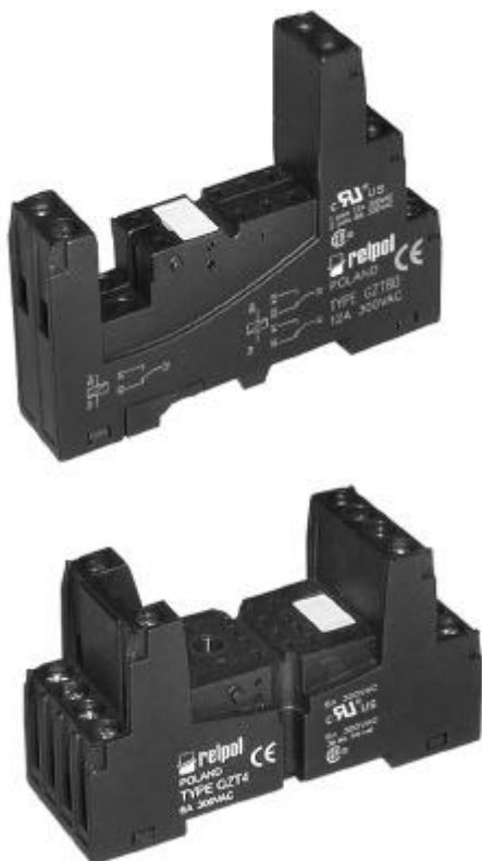
Fig.2. Photos of the two products of the series GZT